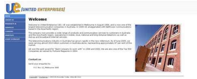
Figure 2. UE Virtual Organization Used For IT Practice

UE is an interactive Web site that provides the environment for IT Practice and is used for all assessment. The business operations of UE focus on providing products and services in the telecommunications industry.