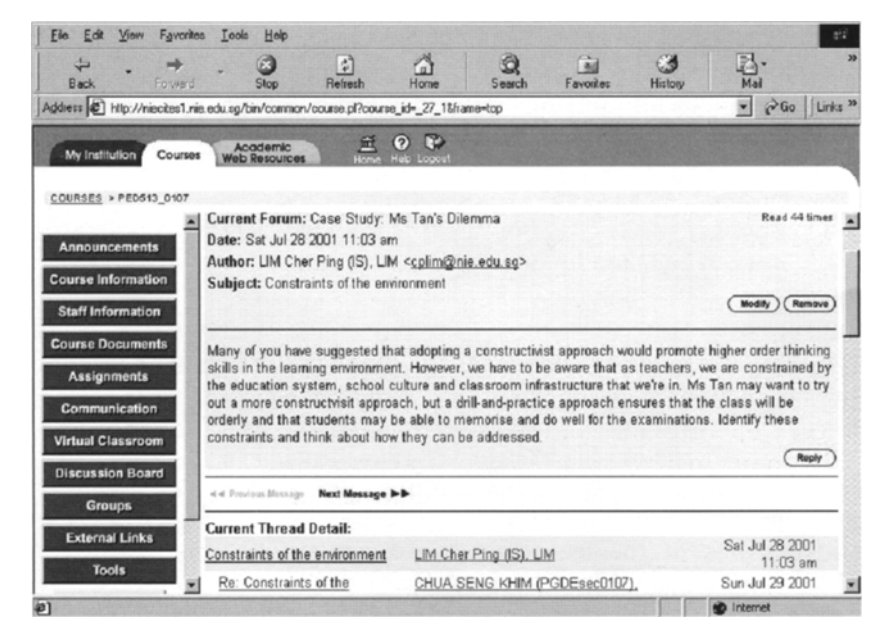
Figure 3: Instructor weaving together discussions and starting a new thread

Drawing conclusions and providing content ex pertise —Instructors should contribute advanced content knowledge and insights, weave together discussion threads and help participants apply, analyse and synthesise content (Shank, 2001). Figure 3 shows how an instructor weaves together