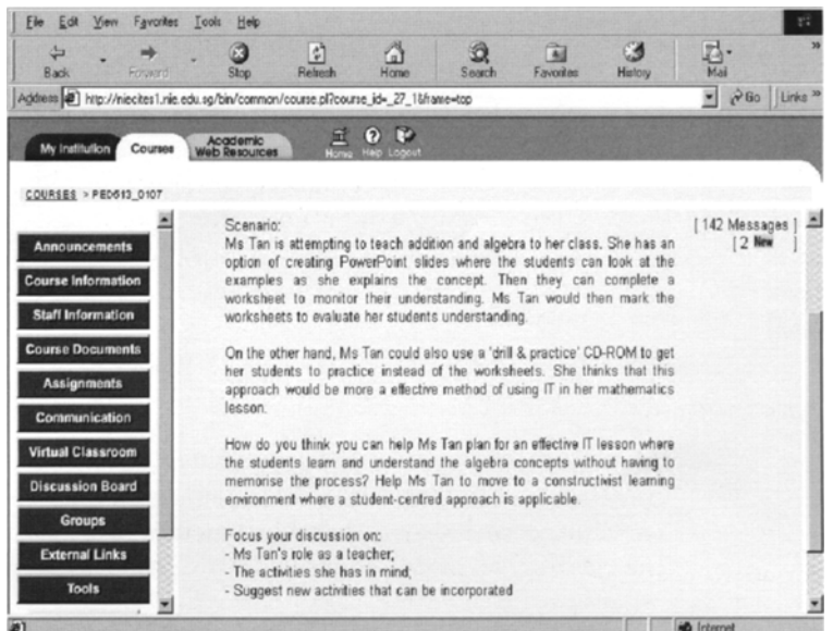
Figure 1: Instructor opening a discussion in a teacher education course

Setting meaningful tasks—Set a task or topic that is meaningful to learners to promote their active participation in discussions. Klemm (1998) suggests that the task or topic should appeal to learners' experiences and vested interests. Figure 1 illustrates starting off an online discussion with a case study in a teacher education course.