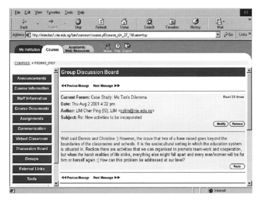
Figure 2: Instructor acknowledging learners and extending a discussion

should be structured to keep discussion focused. Instructors should not allow off topic discussions even though there may be a tendency for participants to stray off topic. Strategies include formulation or reframing questions to redirect the discussions.